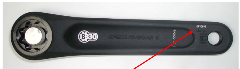
Figure 2: Serial Number Location

Gossamer BB30 Cranksets have been assembled as original equipment on the following bicycles for Europe :