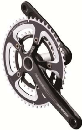
Gossamer BB30 Crankset

Full Speed Ahead (FSA) has received reports that the bolt shoulder on the non-drive Gossamer BB30 series crankarms can crack and break if the installer exceeds the recommended torque specification while tightening the crankbolt. If the bolt shoulder is cracked or damaged in any way, the crank arm can potentially loosen, allowing the rider to lose control and fall.